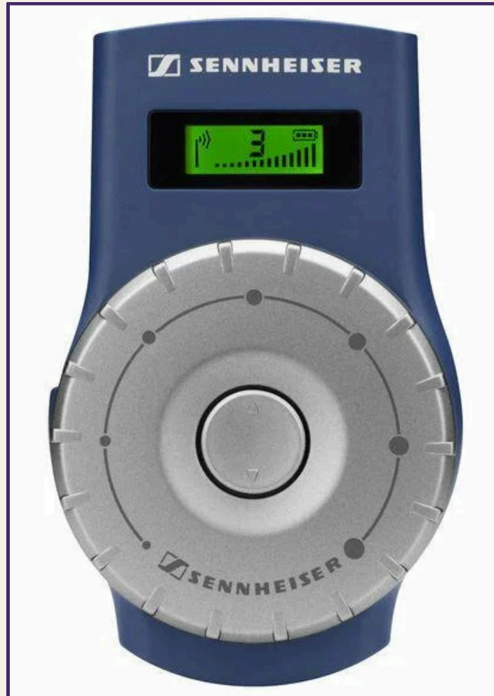
Photo of audio description device

Collect from box office before the show. Just ask a member of staff.