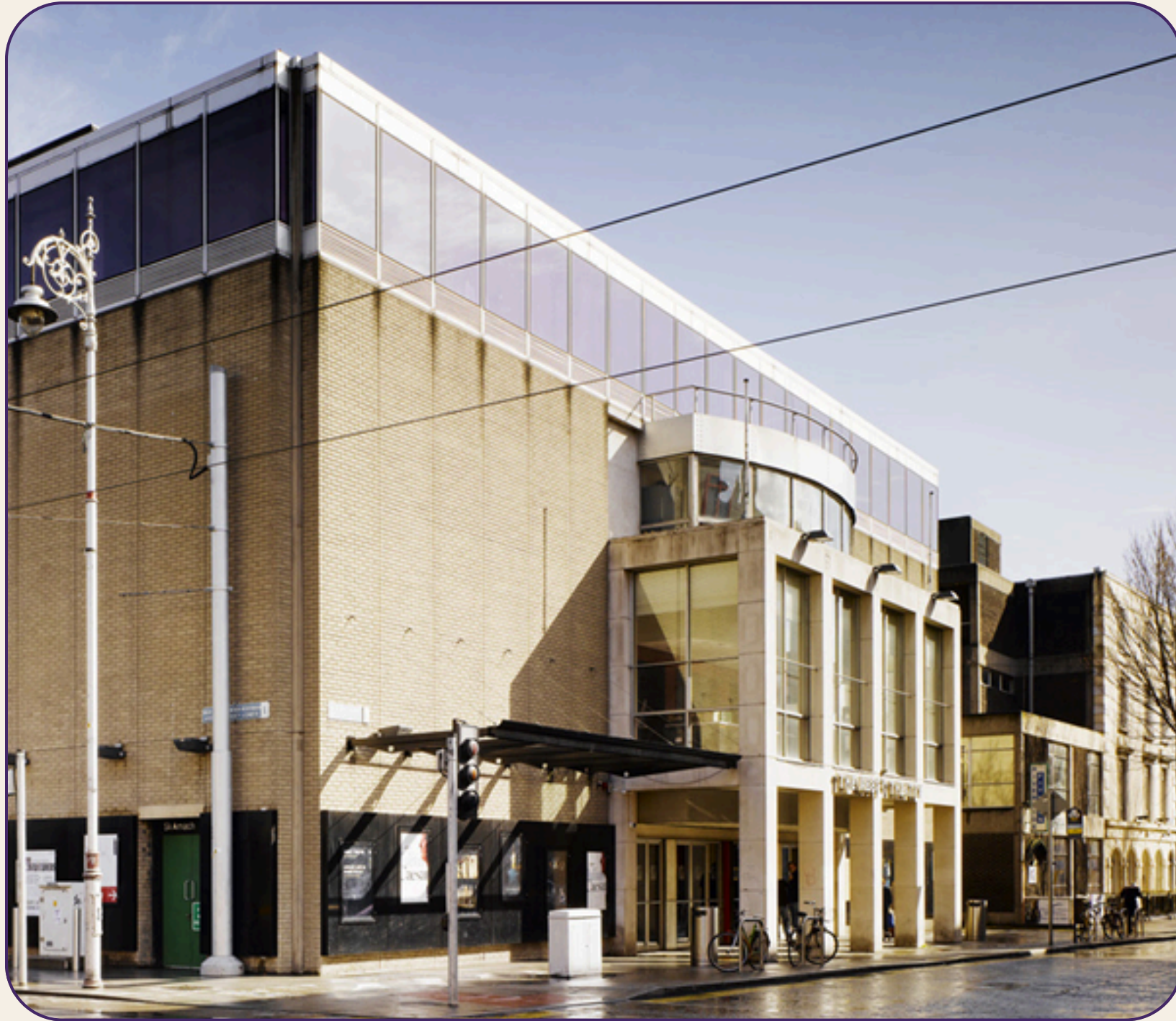
Photo of the outside of the Abbey Theatre. The front door is beneath the archways in the bottom right of the image.