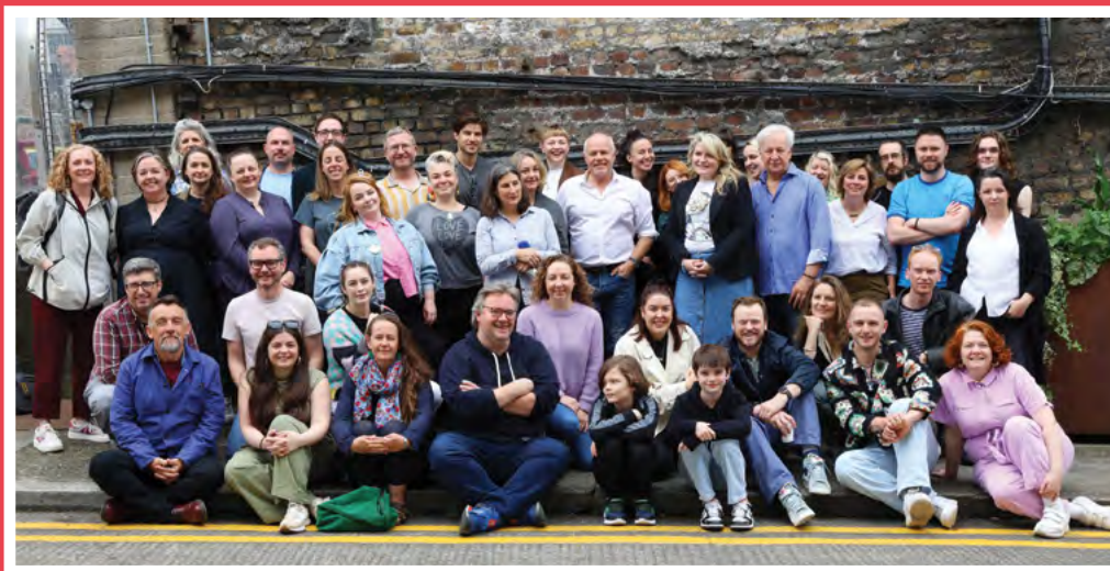
The Somewhere Out There You team on the first day of rehearsals.