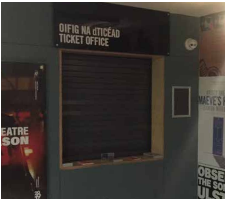
Peacock Box Office