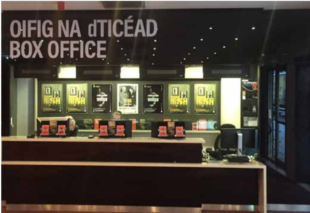
Abbey Box Office