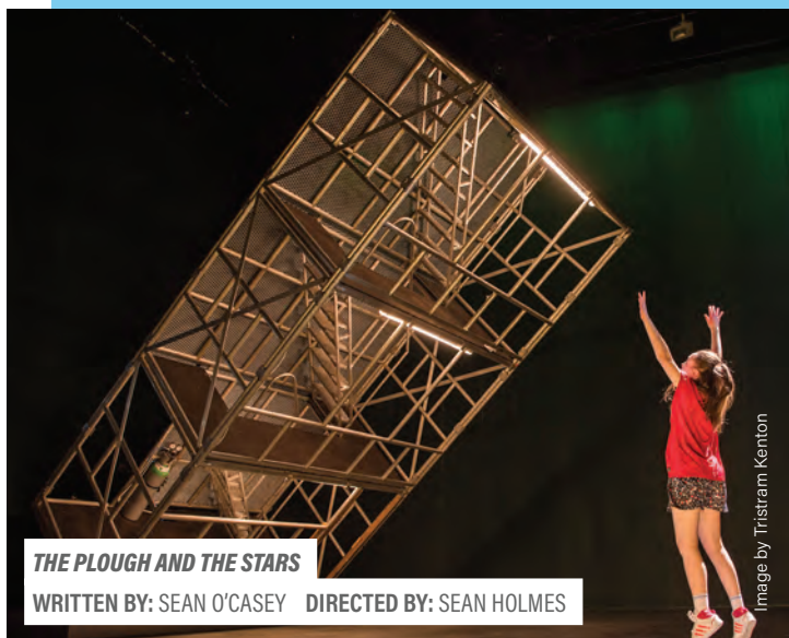
THE PLOUGH AND THE STARS