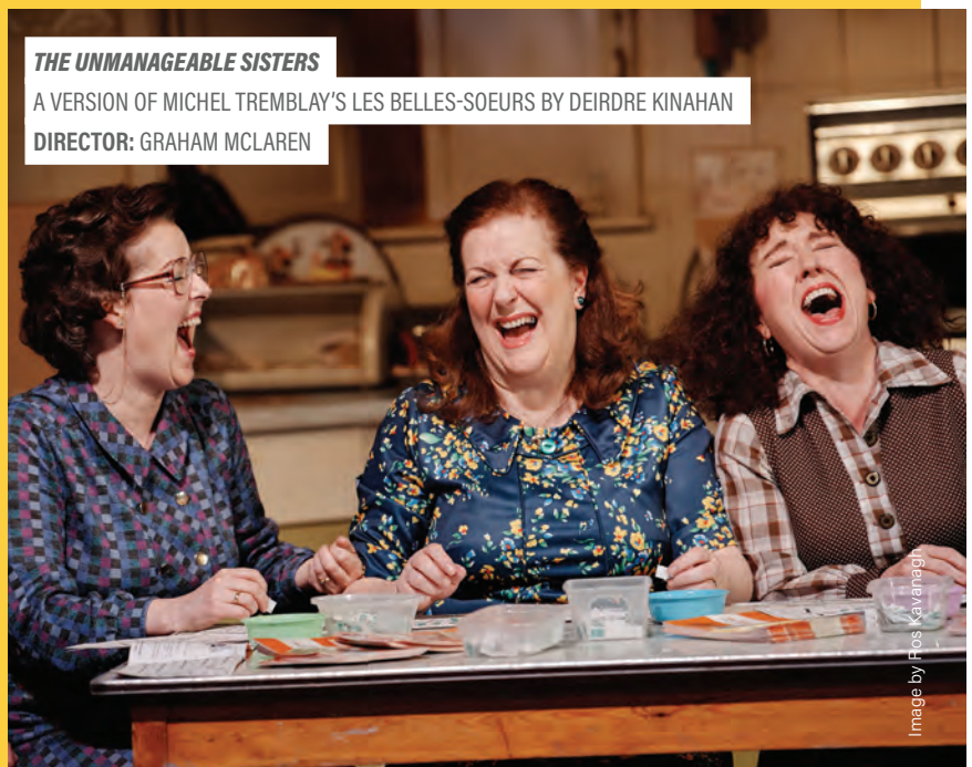
THE UNMANAGEABLE SISTERS

A VERSION OF MICHEL TREMBLAY'S LES BELLES-SOEURS BY DEIRDRE KINAHAN