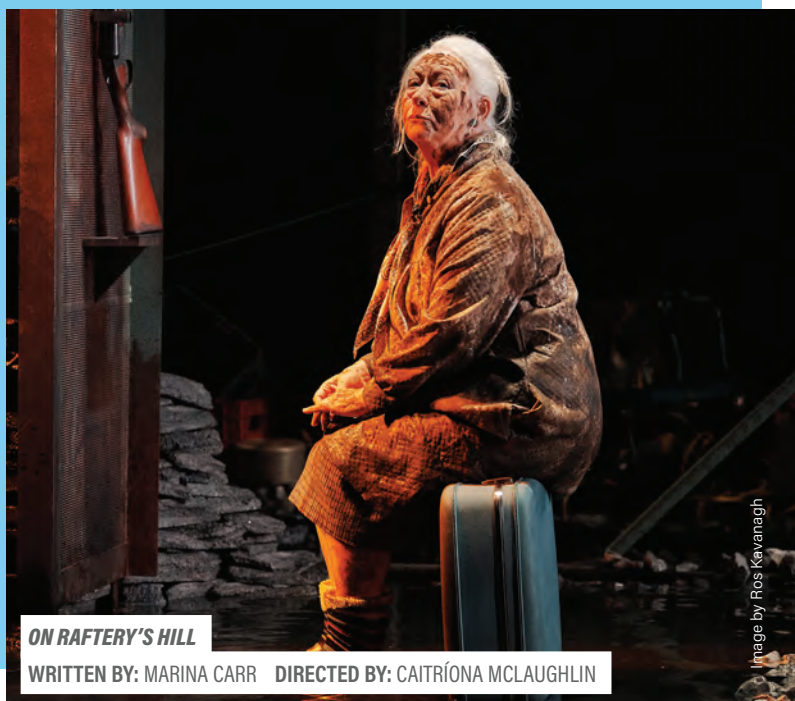
ON RAFTERY'S HILL

WRITTEN BY: MARINA CARR DIRECTED BY: CAITRÍONA MCLAUGHLIN