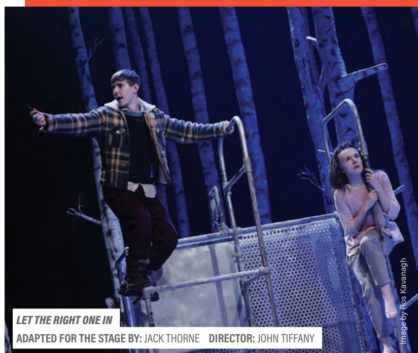
LET THE RIGHT ONE IN