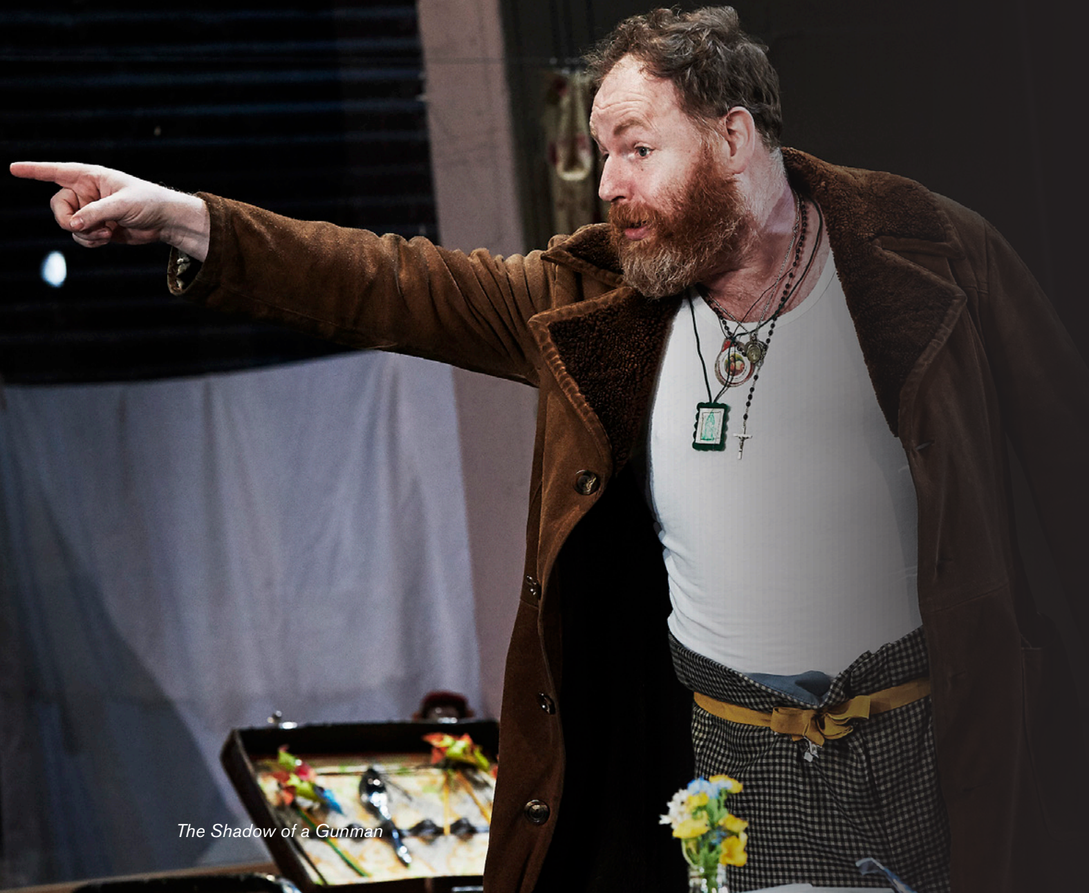
The Shadow of a Gunman