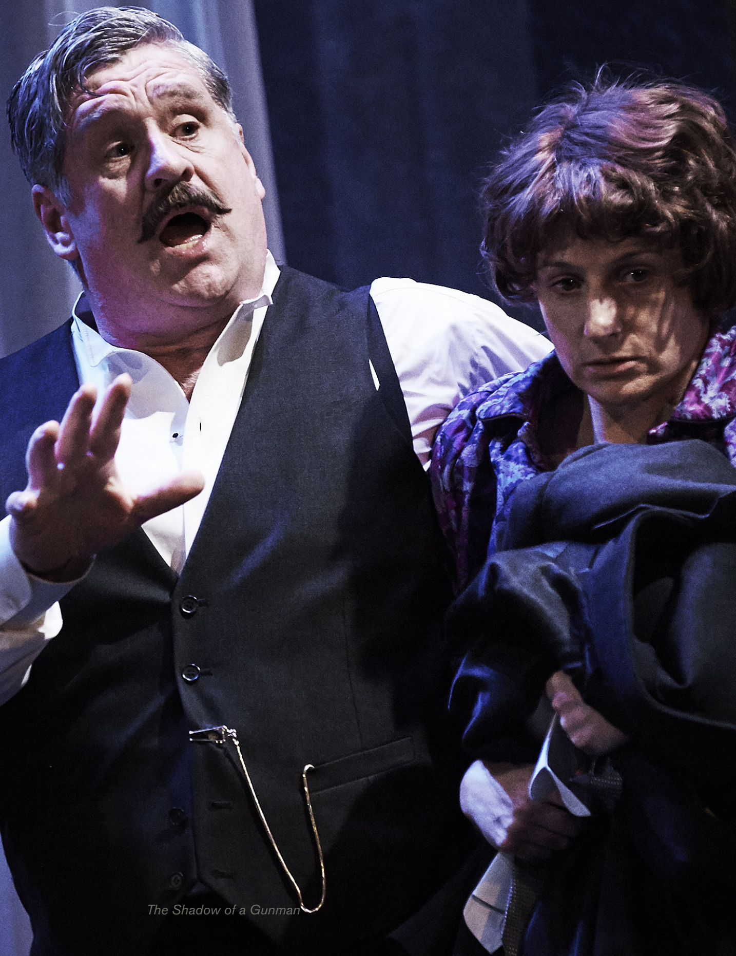
The Shadow of a Gunman

Mr. Maguire, 'Can't be did, can't be did, Seumas; if I waited till to-morrow all the butterflies might be dead. I'll leave this bag here till this evening.'